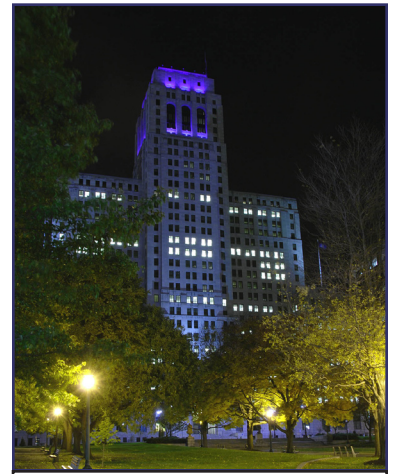
The Alfred E. Smith Building in Albany was illuminated purple in October for Domestic Violence Awareness Month. Visit www.opdv.state.ny.us/public_awareness/shine_the_light.html to see more photos. Think about how you can join us in October 2009!

The Office of Court Administration estimates that, since going into effect, the new law has resulted in 2,200 applications for "intimate relationship-type" orders of protection in the state's Family Courts. [NY Law Journal 11/19/08]